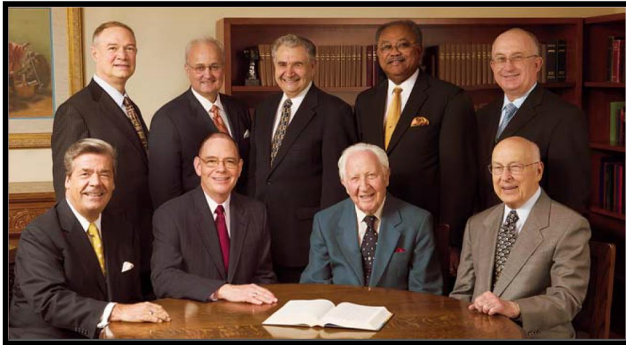
In 2009, these men claimed to be the modern equivalent of the Apostles at Acts 15 1

The death or defection of a member of the GB results in a replacement, as in an Apostolic Succession.