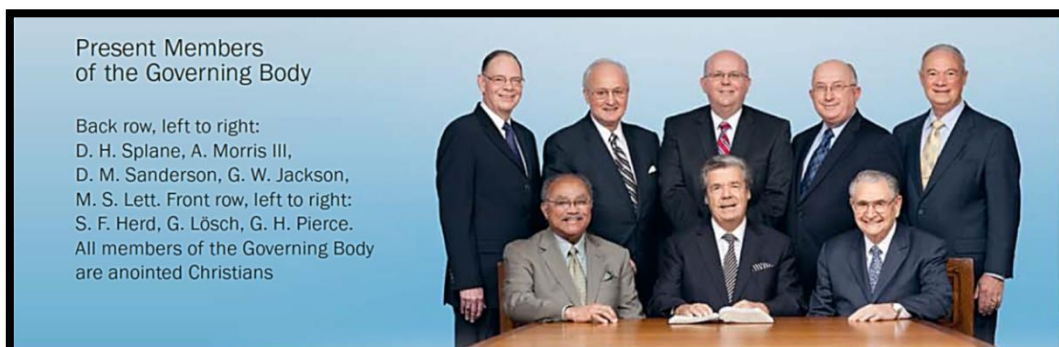
In 2013, these men claimed to be the modern equivalent of the Apostles at Acts 15 2

The death or defection of a member of the GB results in a replacement, as in an Apostolic Succession.