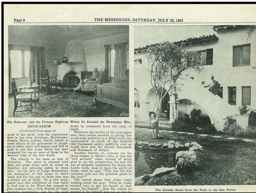
Joseph Rutherford lived in the house prepared for the saints who would be resurrected in 1925 22